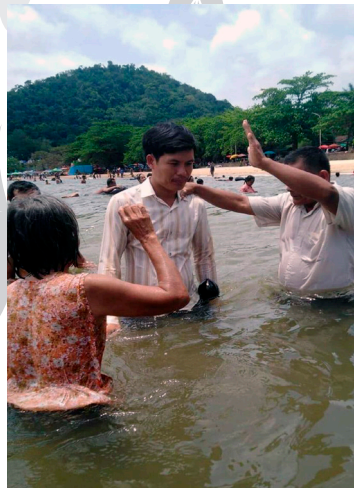
New Believer from Village Church Plant confirming his new faith in Christ

We are so honored to see God using REACH Intl. Ministries to help bring the Gospel of Christ to those in Asia who have never heard about the Gift and Person of Jesus before. Please do lift up these New Believers in prayer and the Church Planters who are pastoring them. May we see them grow in their walk with Jesus and for more come to Christ with an increase of God's Love and Life being proclaimed in the villages of Asia!