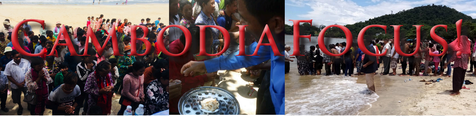
Left & Middle: The New Believers praying before joining in Communion - Right: New Believers lining up for Baptism!

WE WANT to share with you about our current mission update. For our on-going Church Planting projects specifically in Cambodia. Many of you have sowed financial gifts towards our Indochina Church Plants. We chose 39 key leaders who completed our AMGA Leadership Bible Training Modules (we graduated 162 Asian leaders in 3 different locations in East Asia last year in 2018). God led us to partner with our ministry networks with specific leaders to plant churches in unreached villages that have no Gospel witness of Jesus. Currently Project REACH has been sponsoring and supporting monthly a total of 46 Leaders & Church Planters that have planted the 39 different church plants in the Area formally known as Indochina. Many of these places are sensitive for Christian believers to share their faith publicly. Some can do more openly than others. Each of these Church Planters are supported for 18 months, much like a business upstart, with an emphasis to be self-sustainable after 18 months but giving them a key time to focus specifically for evangelizing and discipling a key group to form their new local village Church Plant.