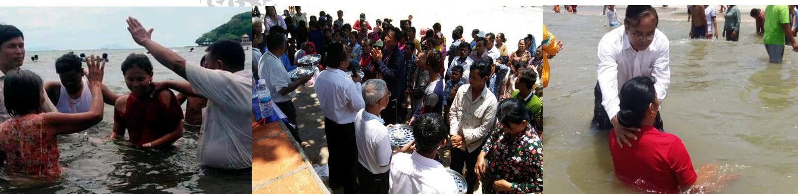
108 New Believers gathered, participated in Communion and then were Baptized as a Witness of their New Life in Christ!