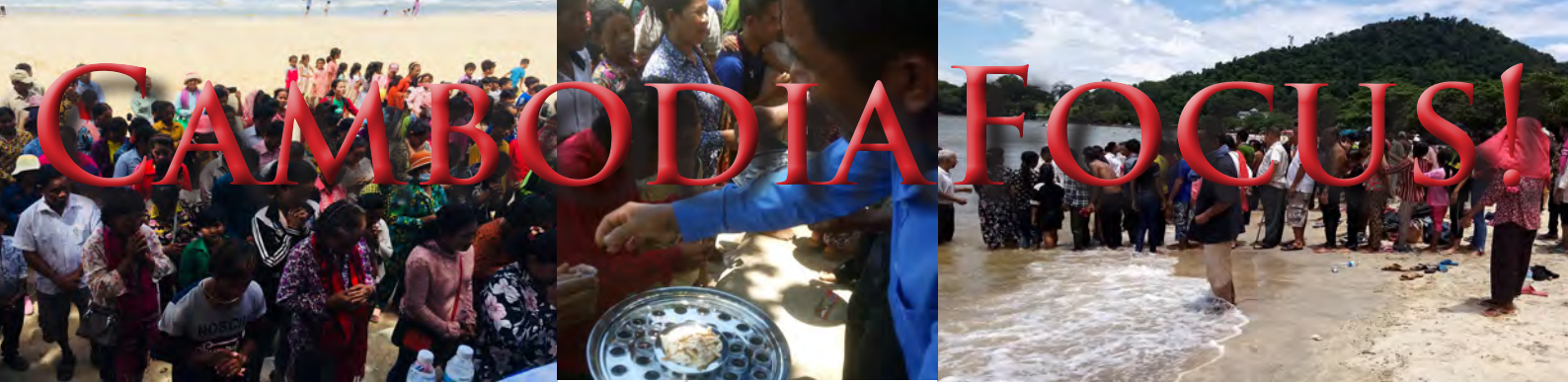
Left & Middle: The New Believers praying before joining in Communion - Right: New Believers lining up for Baptism!

WE WANT to share with you about our current mission update. For our on-going Church Planting projects specifically in Cambodia. Many of you have sowed financial gifts towards our Indochina Church Plants. We chose 39 key leaders who completed our AMGA Leadership Bible Training Modules (we graduated 162 Asian leaders in 3 different locations in East Asia last year in 2018). God led us to partner with our ministry networks with specific leaders to plant churches in unreached villages that have no Gospel witness of Jesus. Currently Project REACH has been sponsoring and supporting monthly a total of 46 Leaders & Church Planters that have planted the 39 different church plants in the Area formally known as Indochina. Many of these places are sensitive for Christian believers to share their faith publicly. Some can do more openly than others. Each of these Church Planters are supported for 18 months, much like a business upstart, with an emphasis to be self-sustainable after 18 months but giving them a key time to focus specifically for evangelizing and discipling a key group to form their new local village Church Plant.