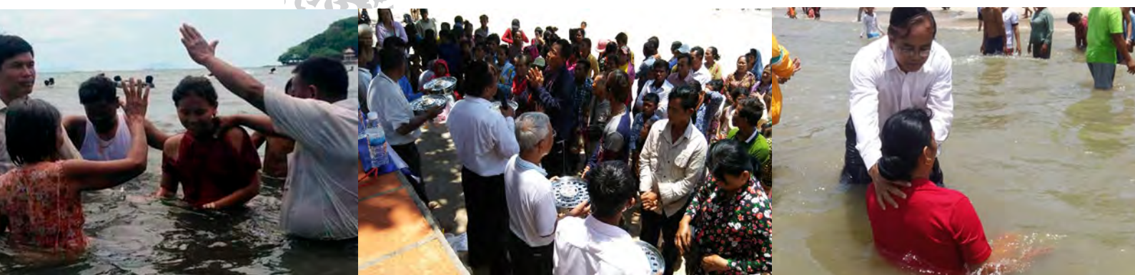
108 New Believers gathered, participated in Communion and then were Baptized as a Witness of their New Life in Christ!