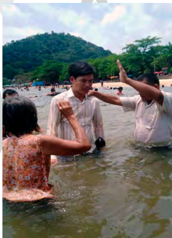
New Believer from Village Church Plant confirming his new faith in Christ

We are so honored to see God using REACH Intl. Ministries to help bring the Gospel of Christ to those in Asia who have never heard about the Gift and Person of Jesus before. Please do lift up these New Believers in prayer and the Church Planters who are pastoring them. May we see them grow in their walk with Jesus and for more come to Christ with an increase of God's Love and Life being proclaimed in the villages of Asia!